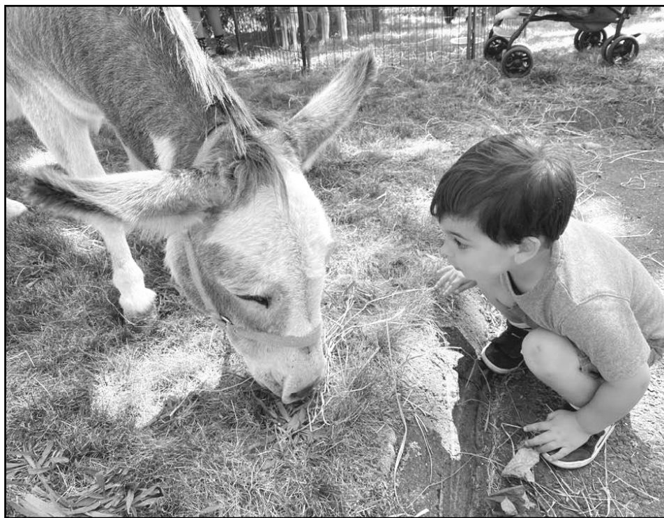
Friends of the Hagan Memorial Library in East Haven sponsored a petting zoo's visit to the library in August. It was part of the summer reading program finale.

Keep watch on foclib.org for the latest help, just one of the many benefits of being part of FOCL.