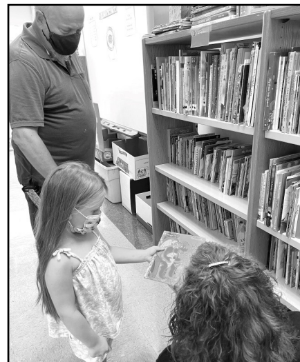
Friends of the Prospect Public Library held a book sale in August at the community center.

Friends of the Prospect Public Library sponsored the high-energy BenAnna Band and the Matica Circus Duo in July outside the library.