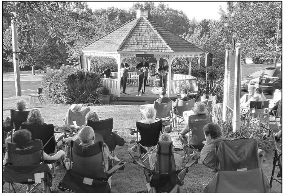
Friends of the Andover Public Library sponsored this concert in August at the town gazebo, their 13th concert in 14 years. Redwood Hill was the band.

Friends of the Fairfield Public Library are hosting Joyce Maynard, the New York Times best-selling author