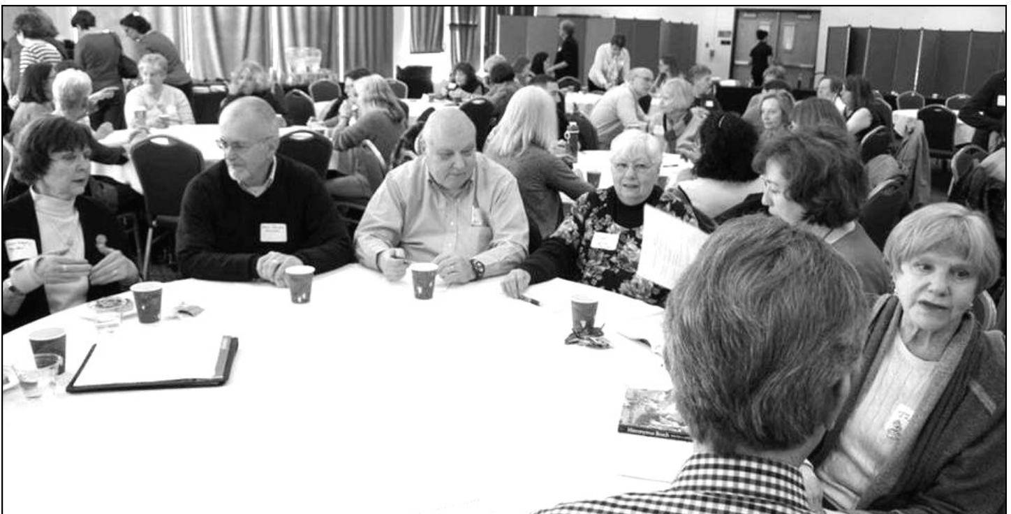
Friends members at the Fall Conference have plenty of time to socialize.

Danbury Railway Museum, the EverWonder Children’s Museum in Newtown, the Norwalk Aquarium and the Stepping Stones museum for Children.