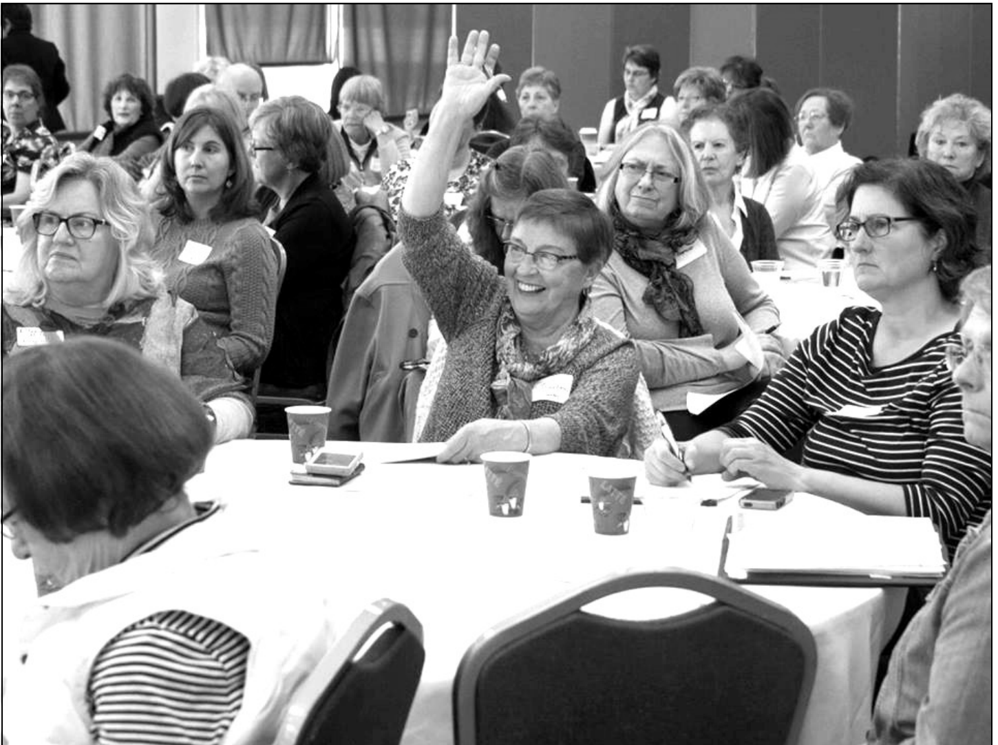
Those at FOCL's Fall Conference not only asked questions but contributed what worked for their Friends group.